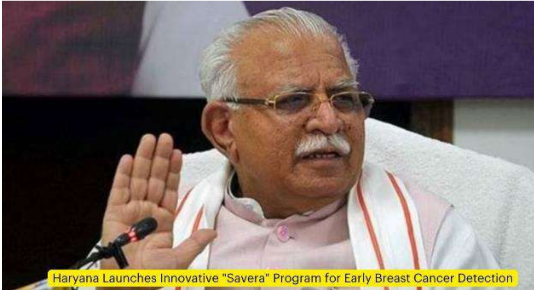
Haryana Launches Innovative "Savera" Program for Early Breast Cancer Detection