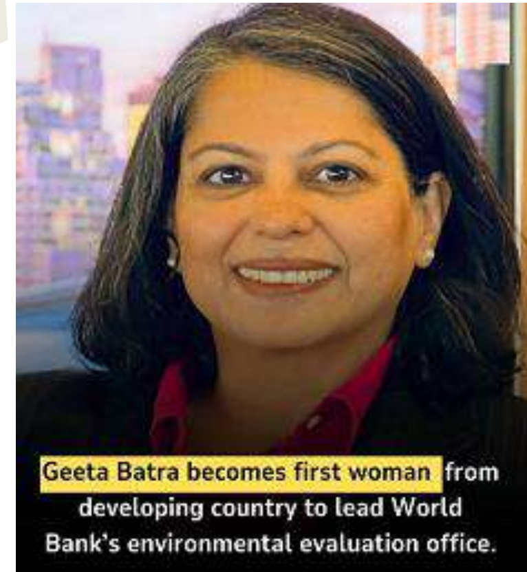
Geeta Batra becomes first woman from developing country to lead World Bank's environmental evaluation office.