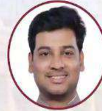
Shrikant Eknath Shinde